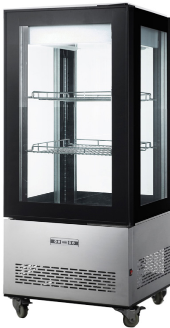
44471 - 26" Wide / 59" Tall

Omcan's Refrigerated Display Case provides an economical solution for displaying your products. Featuring a brilliant internal LED illumination on sides as well as stainless steel exterior, this refrigerated display case also has an adjustable chrome plated shelves, digital temperature controller and display, automatic defrost, and ventilated cooling system.