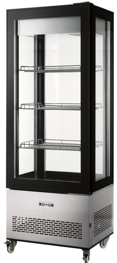
44474 - 33" Wide / 75" Tall