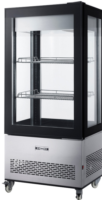
44472 - 33" Wide / 59" Tall