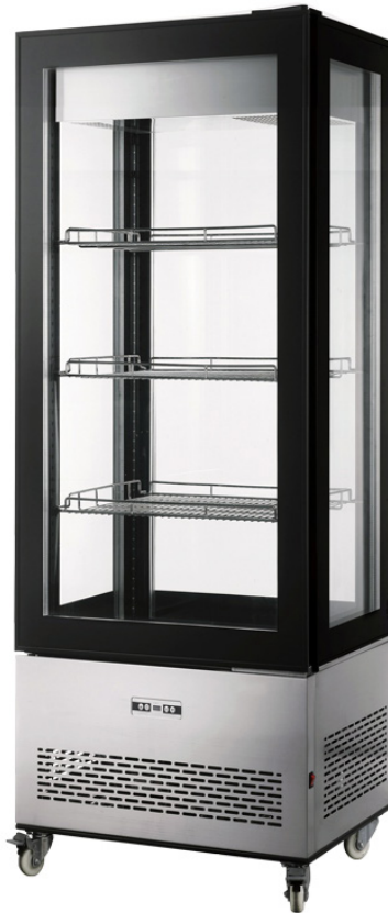
44473 - 26" Wide / 75" Tall